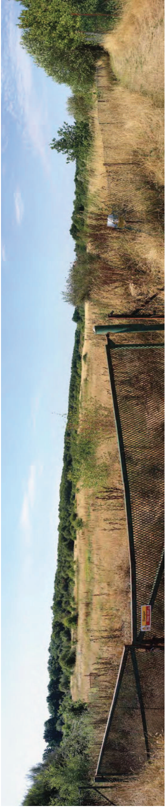
Figure 1 above: View of southeast landfill area (Block 2) facing southwest from footpath.