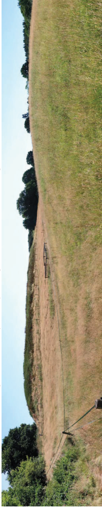
Figure 3 above: View of western fields (Block 4), facing east from footpath.